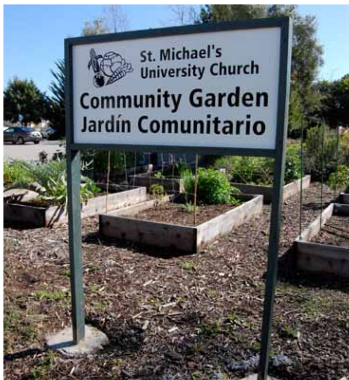
The campus ministry's new bilingual community garden sign! The gardening community at St. Mike's faithfully tends 16 raised beds on the church property, growing food for themselves and their community.