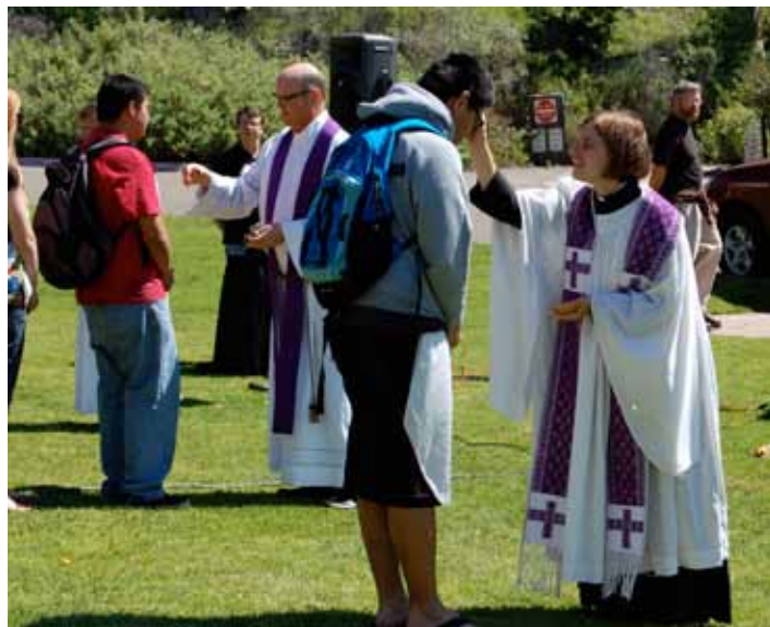
The Episcopal Campus Ministry participates in an Ecumenical Ash Wednesday Service on campus.